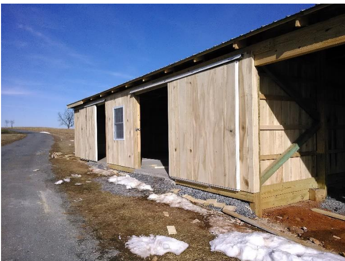
The new Blacksmith Shop is looking great!

So as you can see even with the snowy cold weather its business as usual at Howard County's Living Farm Heritage Museum. Be sure to come out, get involved and have some fun. Thanks for all that you do.