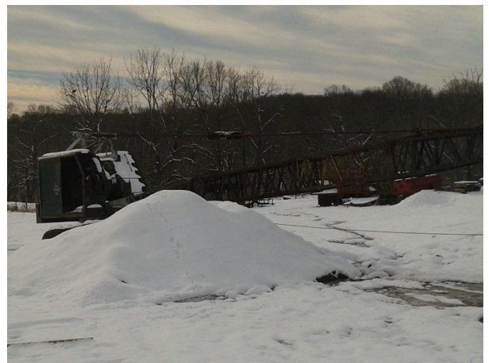
Snow in December 2013 - Always pretty

Services were held at the Burrier-Queen Funeral Home on Tuesday, March 4. Interment was private. In lieu of flowers, Memorial Contributions can be made to: Burrier-Queen Funeral Home & Crematory, PA, 1212 W. Old Liberty Road, Sykesville, MD 21784 to help defer funeral expense.