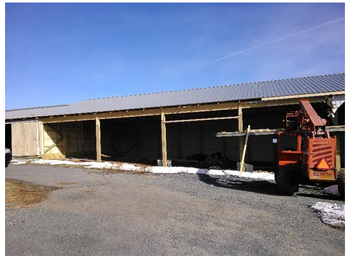
One of the new sheds that has been built during the winter.

For the betterment of the goals of our organization, your club leaders would welcome any helpful ideas, your constructive suggestions, and especially, your active participation. Please feel free to contact them.